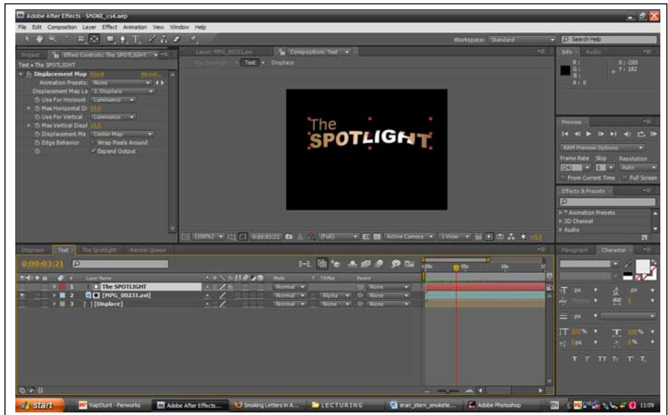
Fig 3.0: The Smoke Composition, showing Adjustment Layer 1